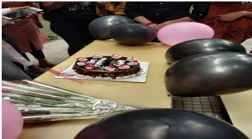
Celebrations on Teacher's Day

On 5 th September, 2022 the students of the department celebrated the day by getting together and cutting of cake with their teachers. They paid their respect in the form of speech and poem. Teachers had a ramp walk on request of their students. All students (approximately 400) from B.Com.1, B.Com.II and B.com.III were the part of celebration. The students also gifted the teachers with handmade cards and chocolates as a token of love. The teachers also pampered the students by giving them a treat.