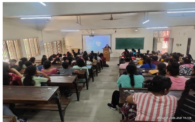
Students attending to the talk