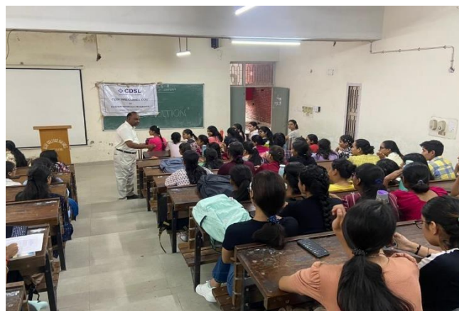
Students attending to the talk