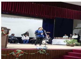
JAM-Just a Minute