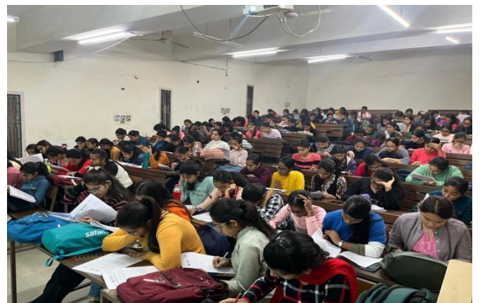
Students attempting MCQ Test during the event