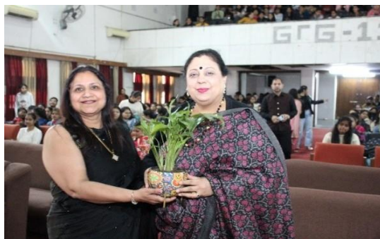
Students from different colleges participating in different events