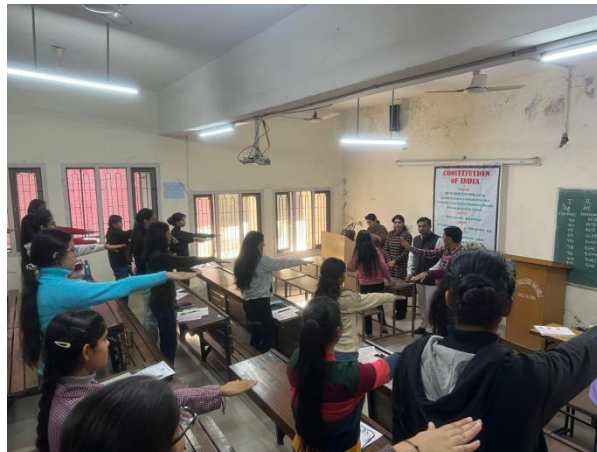
Students taking Pledge

26.11.2022 Electoral Literacy Club of the College celebrated the constitution day in the College campus in which the nodal officers informed the students about the significance and relevance of constitution of India. On the occasion the students also took pledge to vote and strengthen the Indian democracy. On the occasion more than sixty students participated.