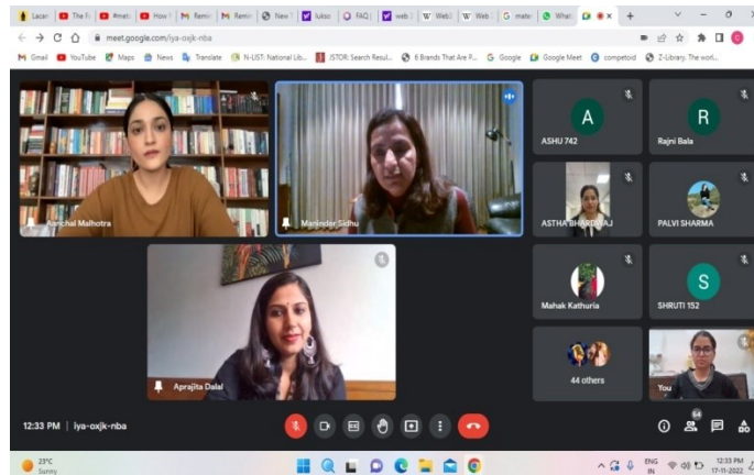
Screenshot of the lecture