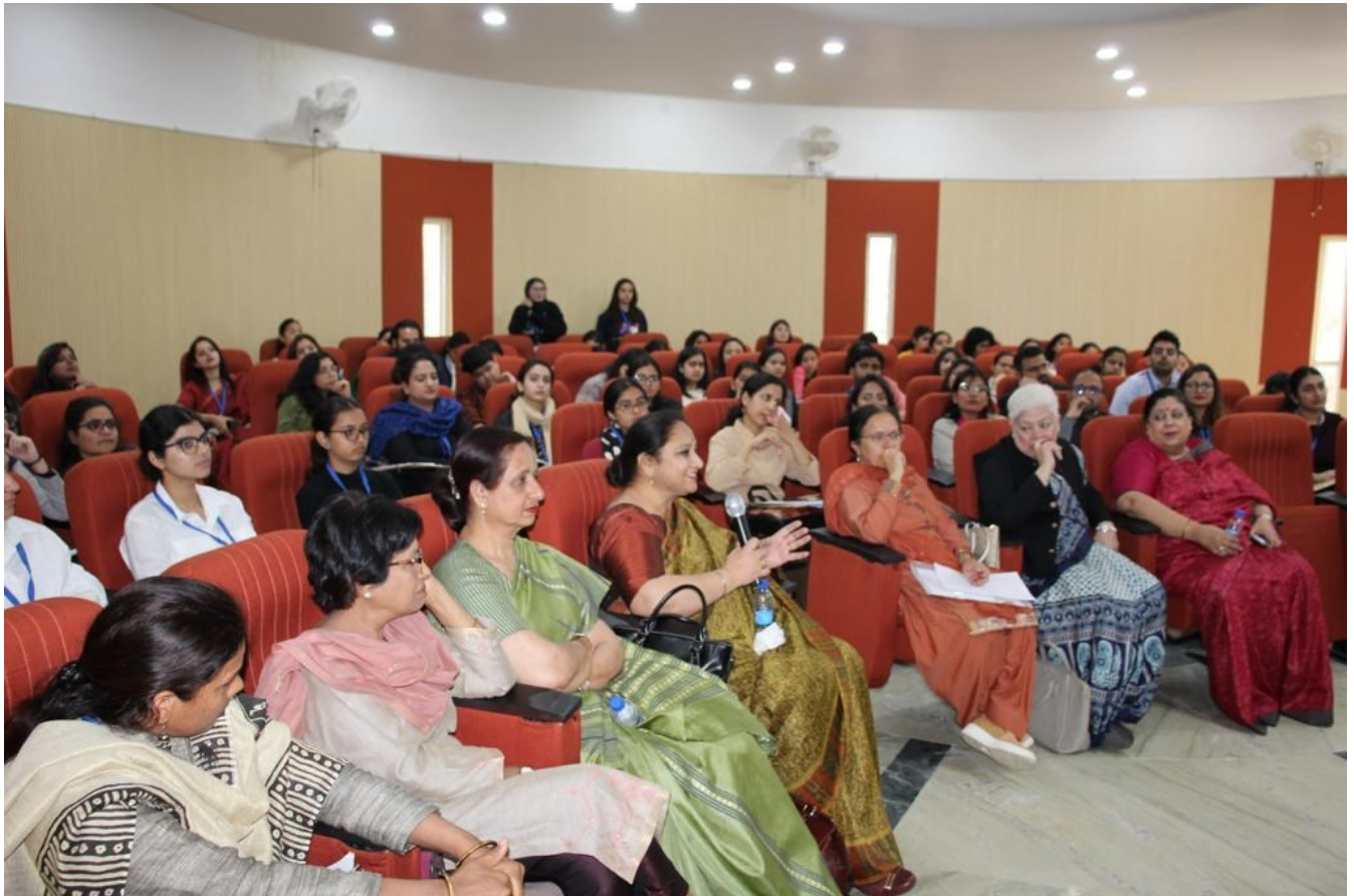
A Q/A session during the seminar