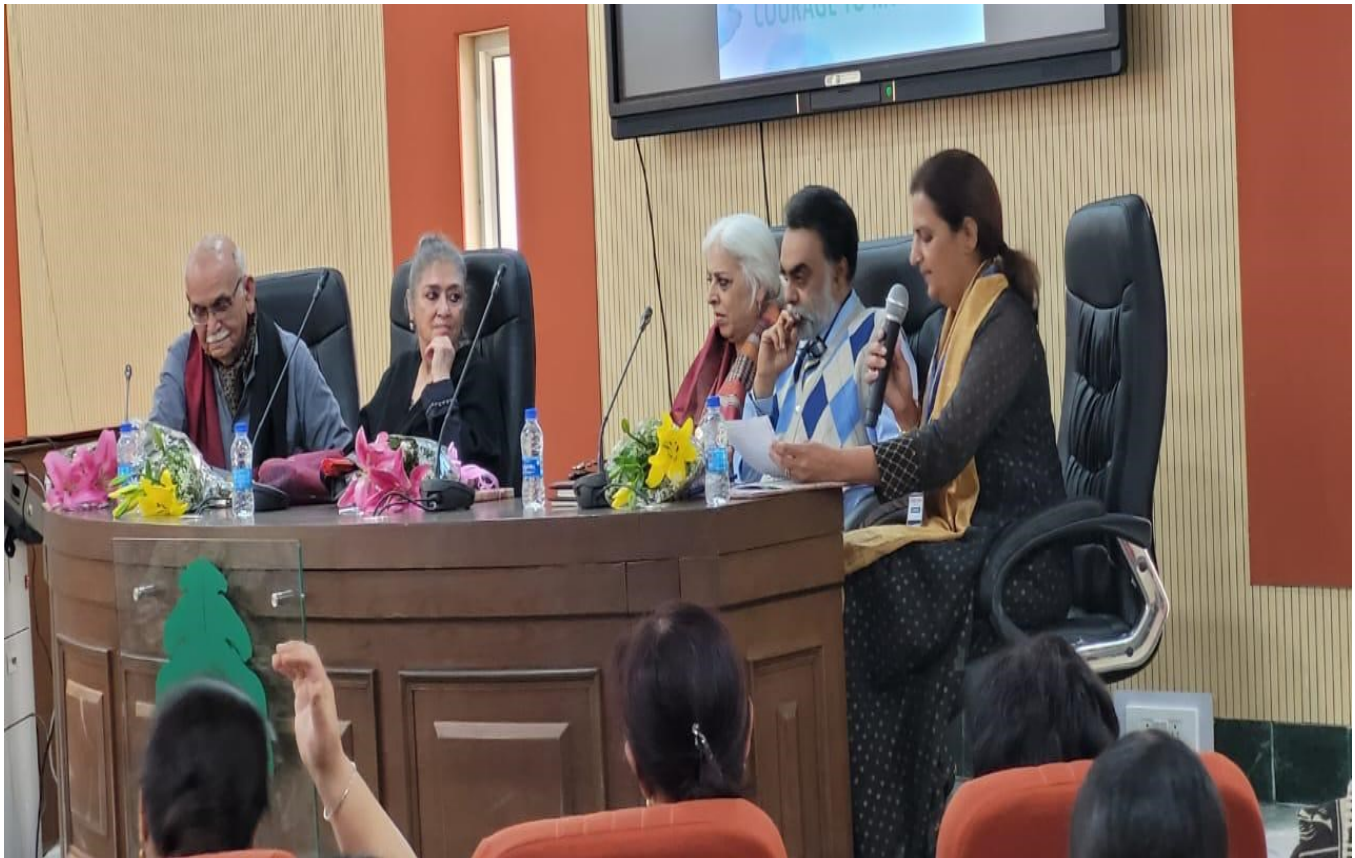
Panelists speaking during the panel discussion