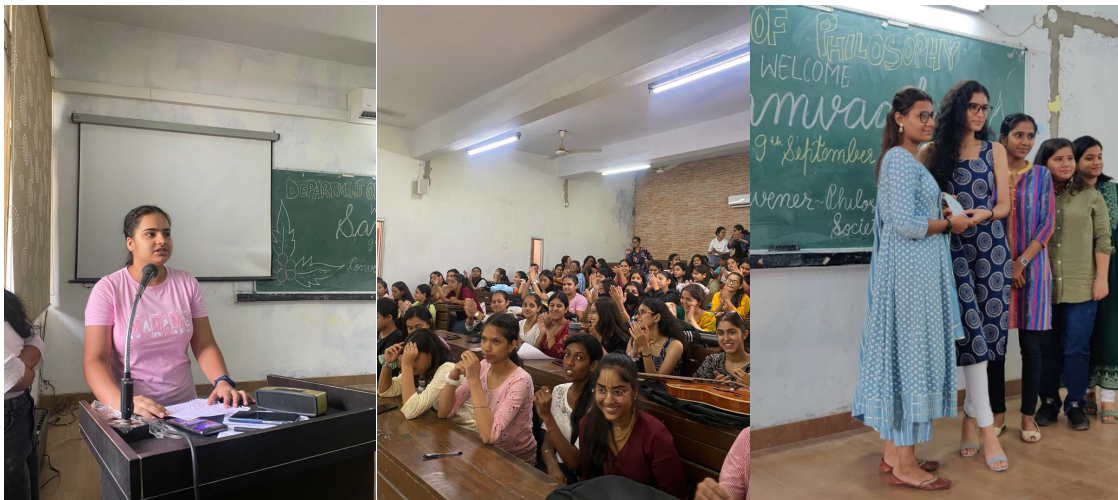
Students during Samvaad

The event was attended by seventy two students.