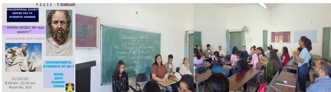
Students during the Session on Finding Myself: My True Identity