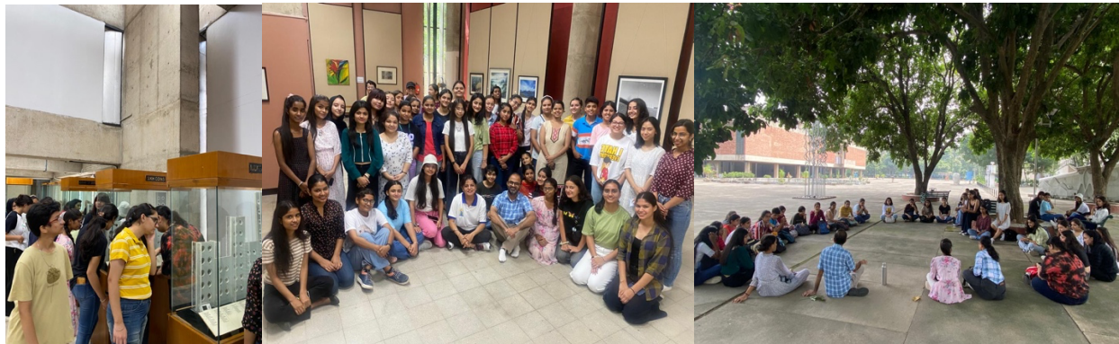
Students interacting and in group photo

The visit informed and helped the students to discover the aesthetics of the India's rich cultural heritage and provided them with an opportunity to imagine and appreciate our rich culture.