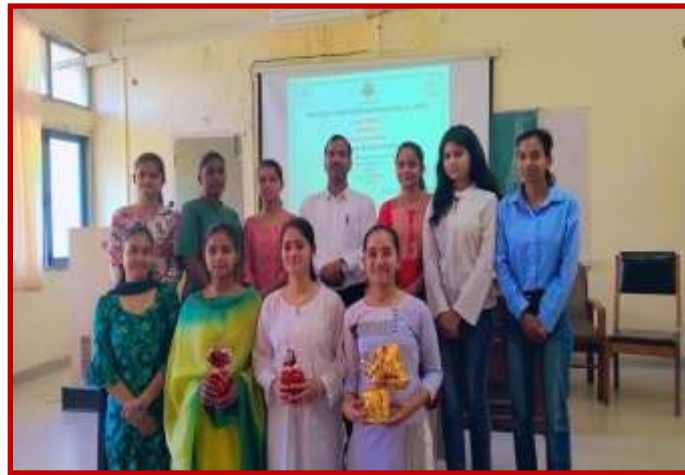
Participants and winners of the Vedic Swastivachan Competition