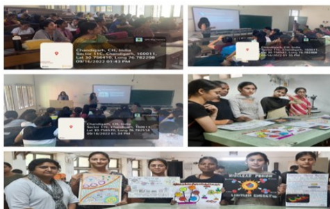
Participants presenting poster and oral presentations