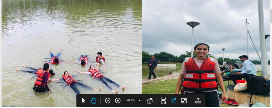
Proof of attending AAPADA MITRA CAMP