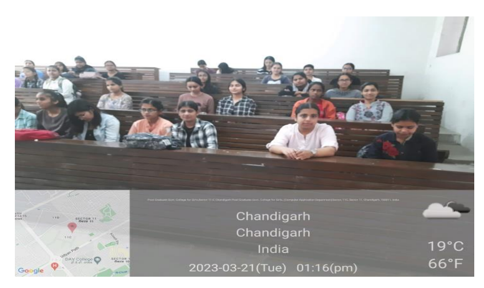
View of Audience