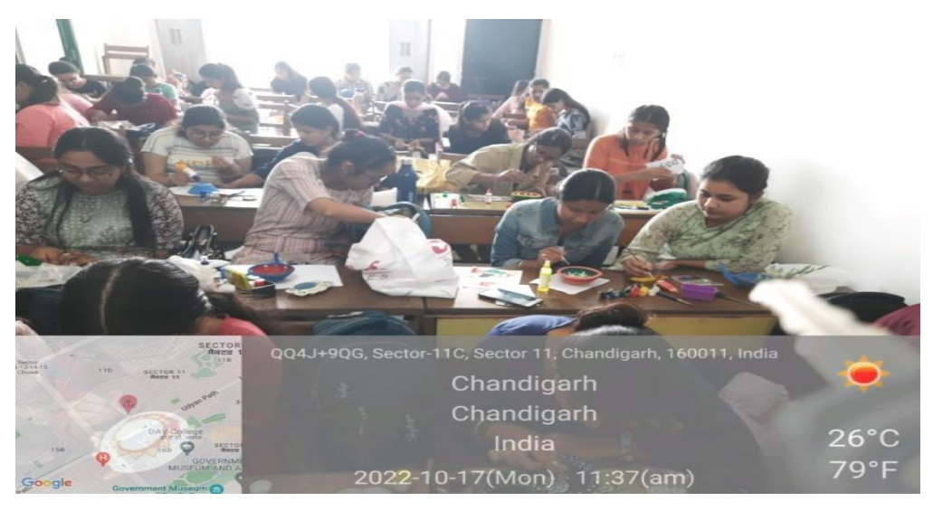
Diya Decoration competition on theme GREEN DIWALI/ Ecofriendly Diwali