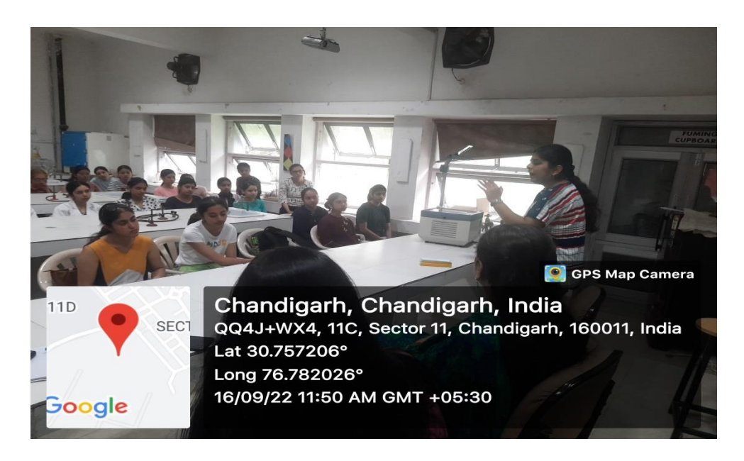
Participants during Declamation Competition

On the Occasion of World Ozone Day 2023 PRAKRITI- The Environment Society of PGGCG-11 organized various Inter College competitions like Declamation Contest, Poster Making Competition, Pot Painting and Rally on Save Ozone was also carried out. About 100 students from the tricity participated in the function.