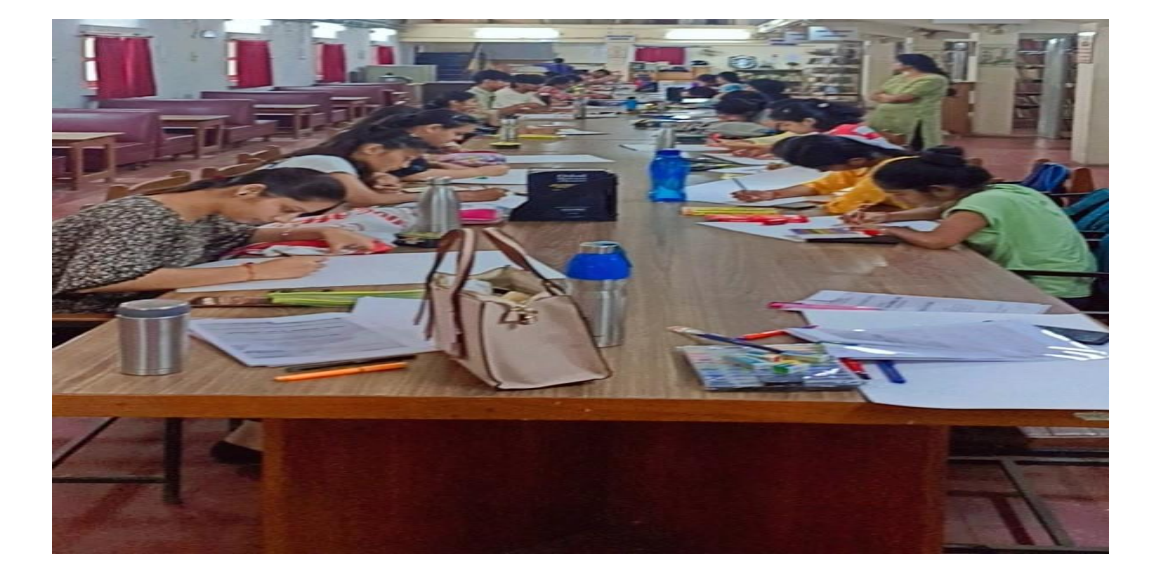
Participants of Slogan writing Competition from various Colleges of tricity