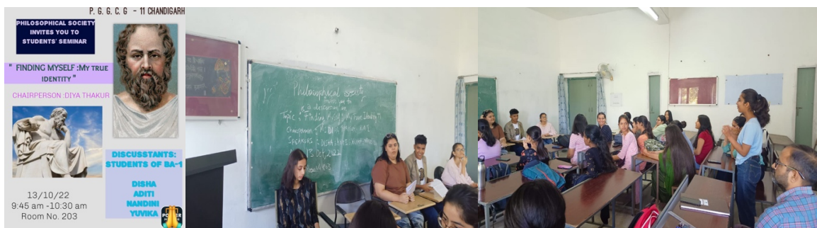
Students during the Session on Finding Myself: My True Identity