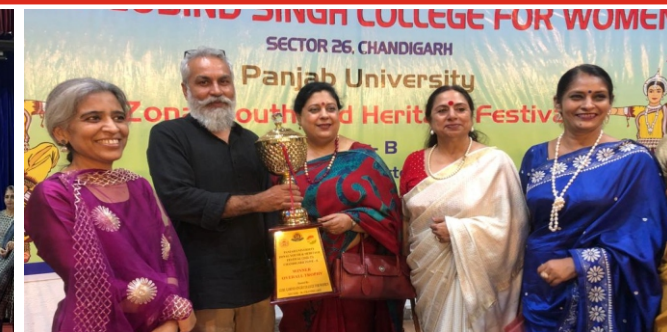
PGGCG 11 MAKES THREE HAT-TRICKS IN A ROW- WINS OVERALL TROPHY OF PU ZONAL YOUTH FESTIVAL FOR THE NINTH CONSECUTIVE YEAR