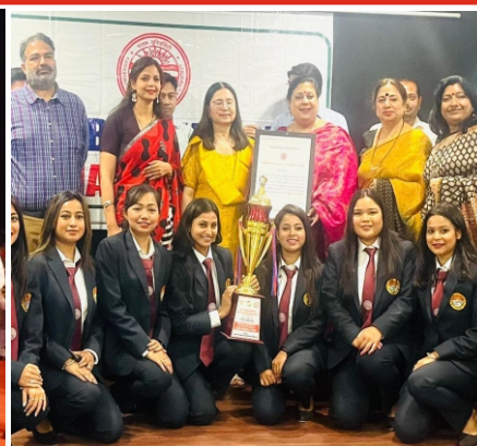
Panjab University Vice Chancellor's Trophy-2nd Runners Up