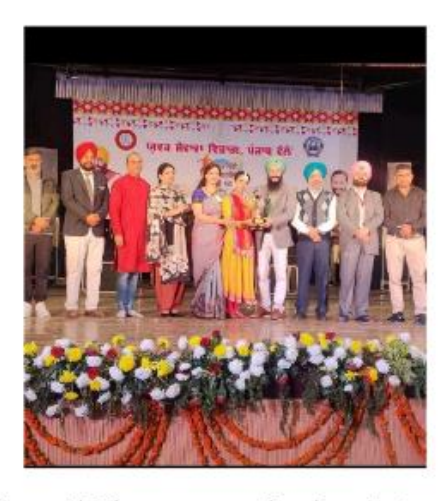
Punjab state inter-versity