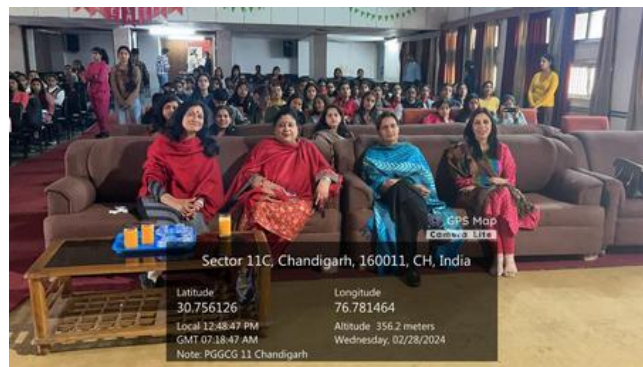
Audience enjoying the performances