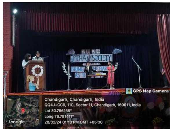
Participants performing Shakespeare

Epiphany Society, Department of English organized a Dramatic Interpretation program celebrating William Shakespeare on 28th February 2014 . The event was titled ‘Bring on the Bard: As You Like It ’. the participants were required to pick a speech from any of Shakespeare’s plays and perform it within 2-3 minutes. 26 teams staged their amazing and innovative performance in the auditorium in front of around 150 students and faculty members.