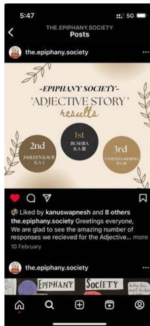
Adjective story competition results

Epiphany Society, Department of English organized an Adjective Story Writing Competition during 5-8th February 2024 wherein the participants were given a short story with blank spaces to be filled in by them with the adjectives of their choice. 40 students submitted their entries, displaying their fertile imagination and creativity. These were adjudged by one of the faculty members from Department of English. The names of first three position holders were posted on the Instagram page of the society.