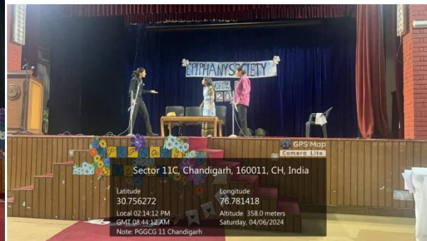
Skit performance of 'The Marriage Proposal'