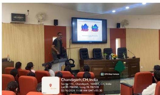
Talk in progress