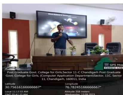
Talk in progress