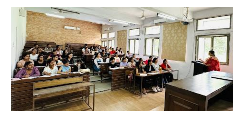
Orientation session and Interaction with BA I students

An Orientation Program for BA I Psychology Students was organized on 31<sup>st</sup> July 2023 by the faculty of Psychology Department to welcome them and to introduce and make them familiar with the departmental activities. Students were informed about the importance of lectures, attendance, and mid-term exams. They were also made aware with the functioning of department, Psychology practicals and about students' involvement in organization through the Manorang Society. Students of senior classes interacted with the new students, organized activities for them and welcomed and made them feel comfortable in this new set up of the college. 60 students participated in this activity.