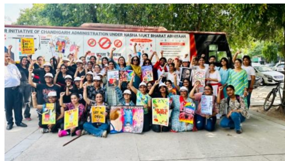
Students performing Nukkad Natak