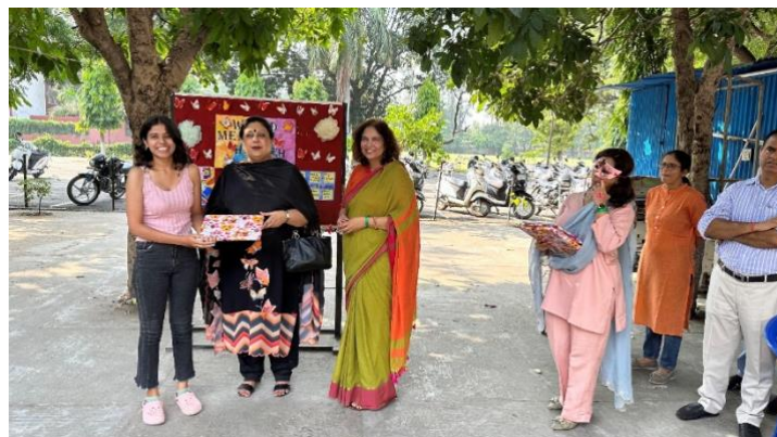
Prize distribution of Poster Making & Slogan Writing competition