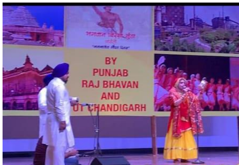
Cultural Evening organised by PGGCG-11, CHD on 15-11-2023 at Governor House, Raj Bhawan, Chandigarh. Students of Music Vocal performed Group Bhajan & Folk song