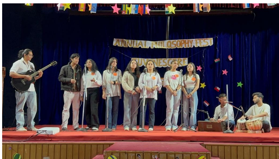
Students performing Group Song at the Fest