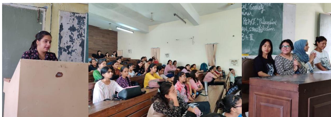
Students during the session on Concept of Peace: Philosophical Reflections