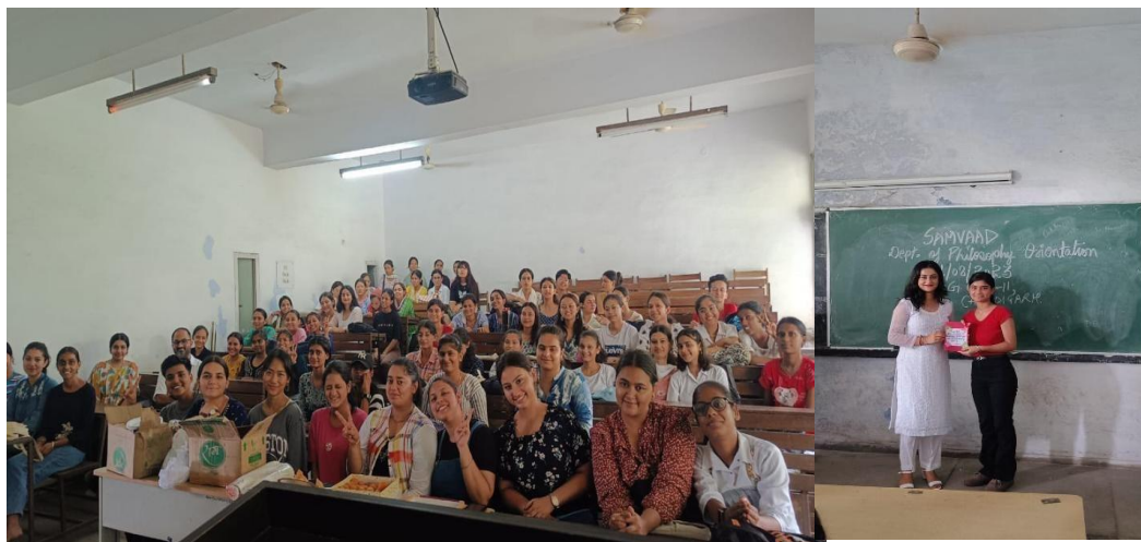
Students during Samvaad