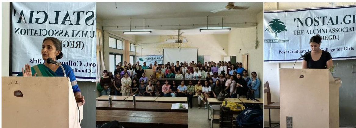
Students during the session