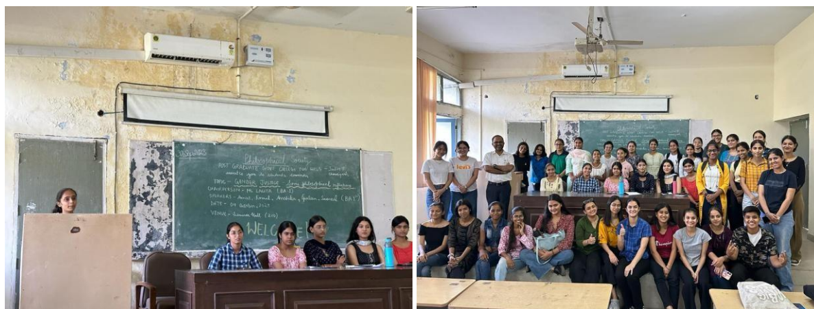
Students during the deliberations