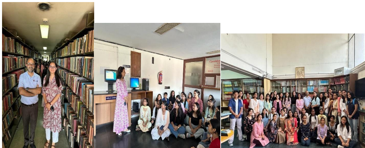
Students at AC Joshi Library

The college students expressed great interest and excitement as they discovered the wide range of academic resources available to support their studies and research endeavors. They appreciated the modern infrastructure and technology-driven approach that the A.C. Joshi library offers.