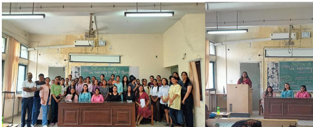
Students during the session of Philosophy and Why It Matters?