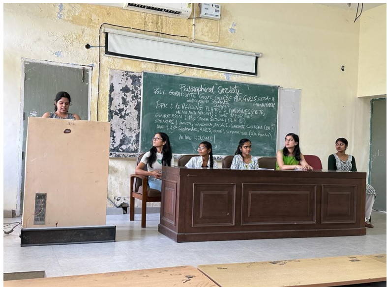
Students presenting their ideas