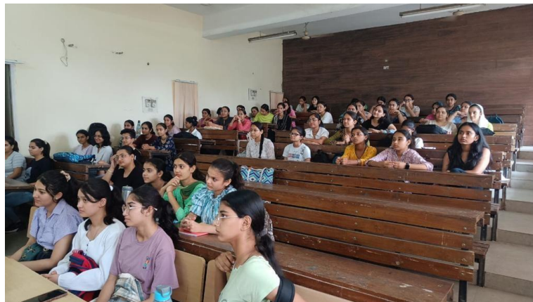
Students during deliberations at the seminar