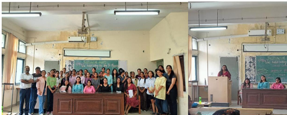
Students during the session of Philosophy and Why It Matters?