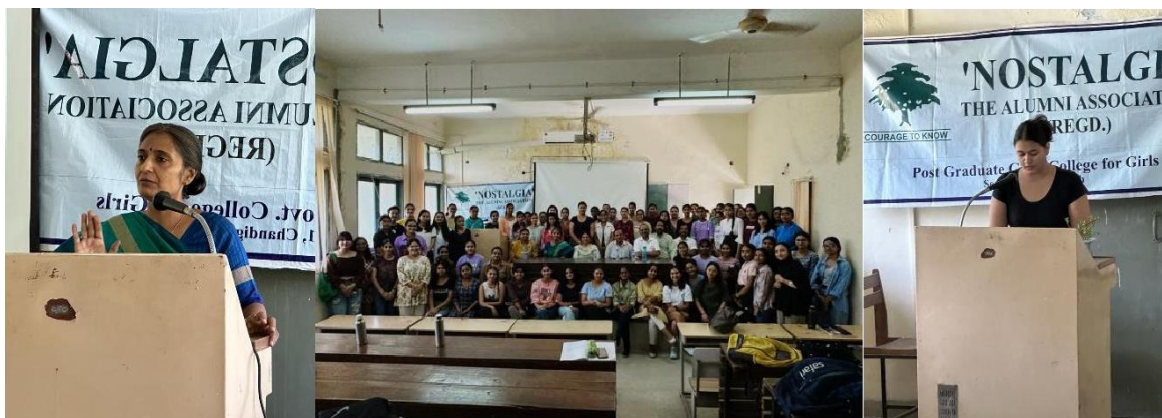
Students during the session