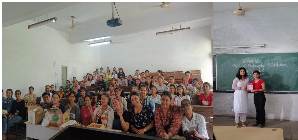
Students during Samvaad