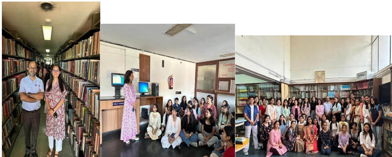
Students at AC Joshi Library

The college students expressed great interest and excitement as they discovered the wide range of academic resources available to support their studies and research endeavors. They appreciated the modern infrastructure and technology-driven approach that the A.C. Joshi library offers.