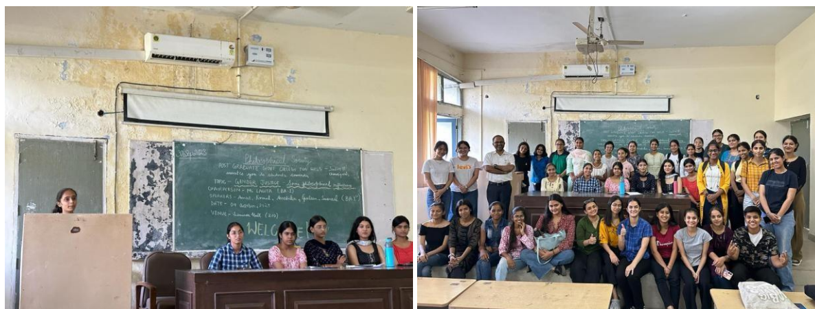
Students during the deliberations