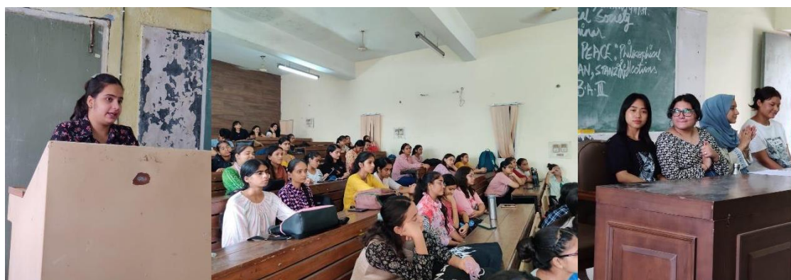
Students during the session on Concept of Peace: Philosophical Reflections