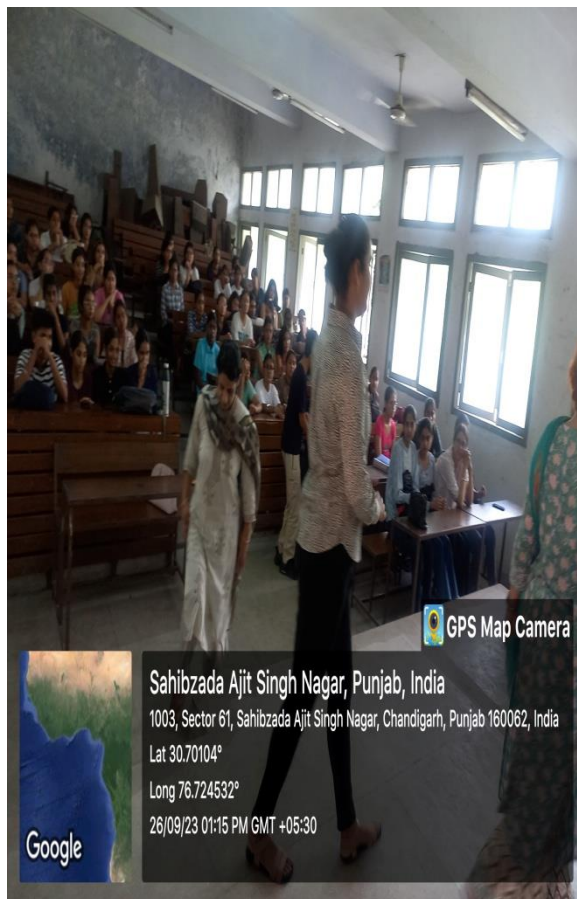
Address by the Alumna