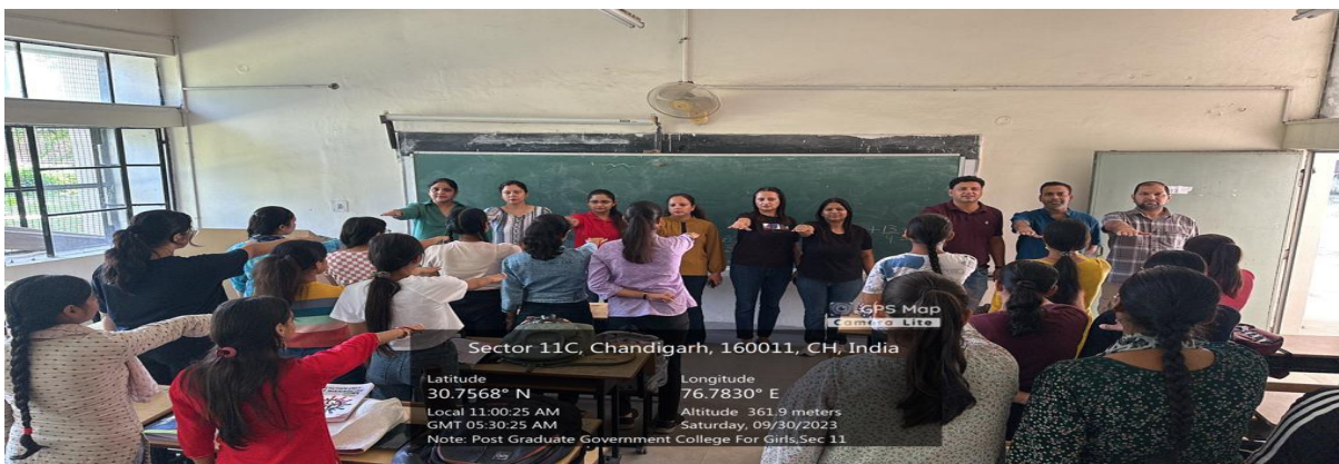
Staff and students taking pledge