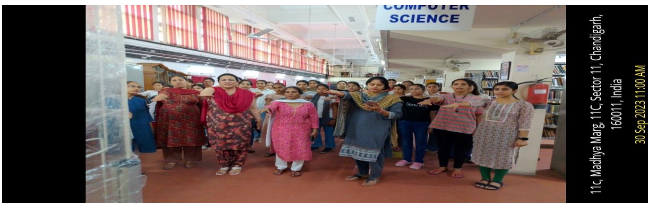
Staff and students taking pledge