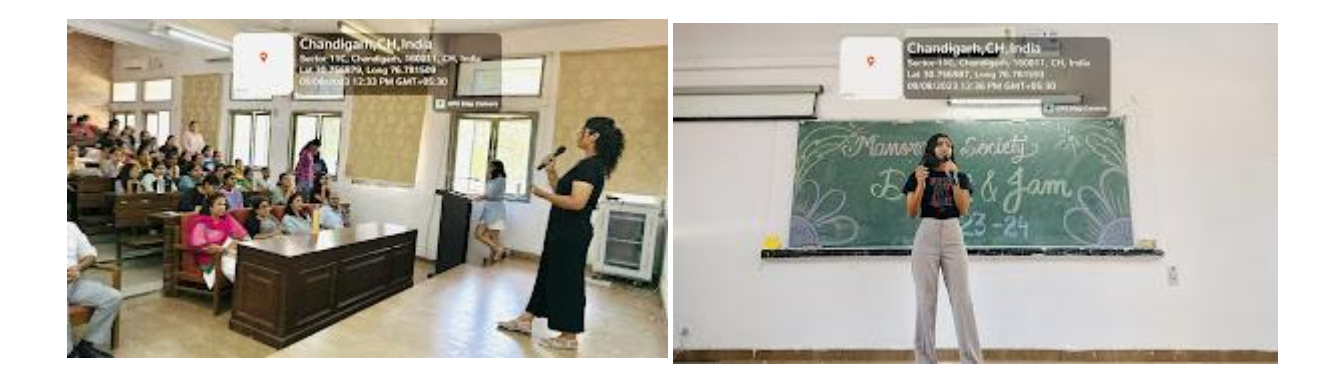
Debate & JAM Competition