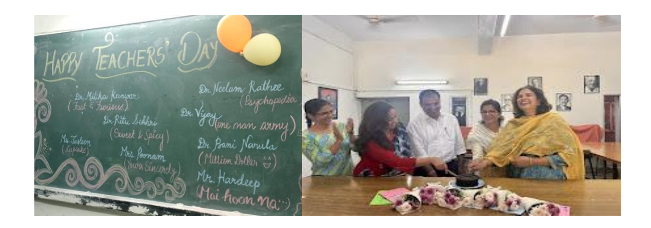
Teachers Day Celebrations

Students of Psychology Department celebrated Teachers' Day on 5<sup>th</sup> September 2023. It was a heartfelt gratitude from students. Through speeches, performances, gestures of appreciation, it fostered a stronger sense of unity and respect within our academic community.