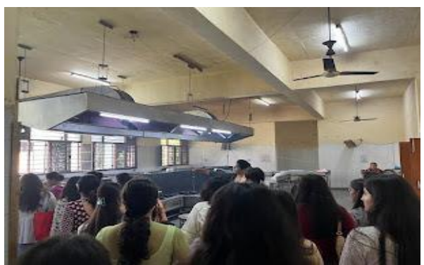
Educational Trip to VSIMH, Amritsar