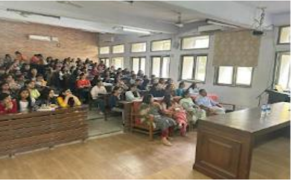
Expert Talk in Clinical Psychology