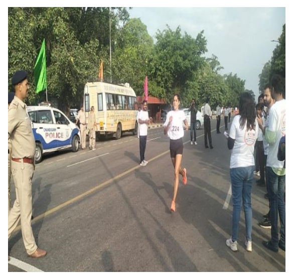
RED RUN to Create AIDS Awareness