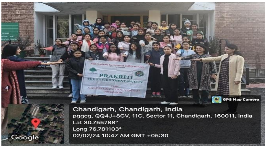
Students taking Pledge to Save Wetlands

Prakriti- The Environment Society of P.G.G.C.G-11 Chandigarh celebrated the World Wetland Day on 2nd February 2024 in the college. The function was sponsored by Department of Science and Technology, Chandigarh Administration. A Pledge was undertaken to save wetlands and visits to Chandigarh Bird Park and Sukhna Lake were organized. About 40 students participated in the event.