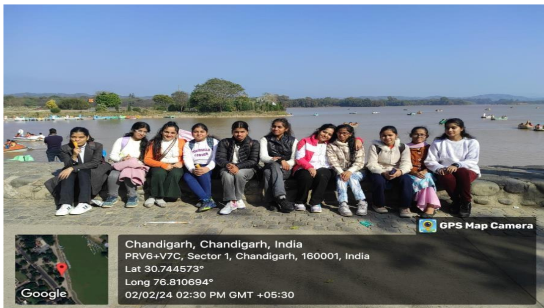
Students during their visit to Sukhna Lake