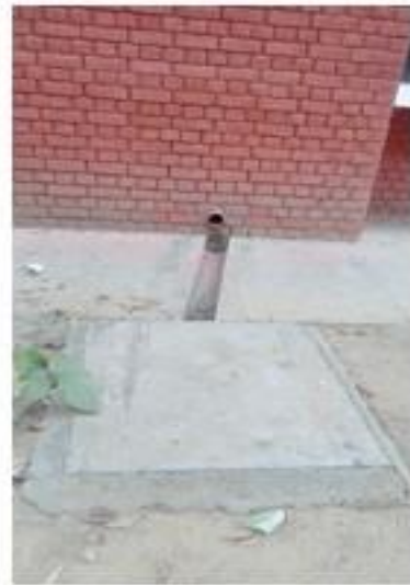
RAINWATER TRAP UNIT (3 ft x 3 ft x 3 ft)