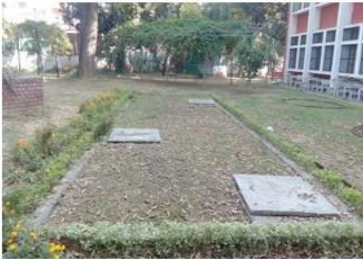
FILTRATION TANK (35 ft x 11.5 ft x 6 ft)