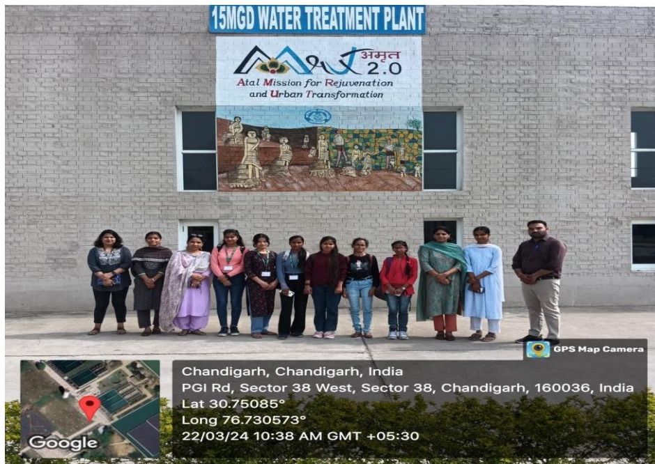
Students along with Faculty members at Water Treatment Plant, Sector 39, Chandigarh

PRAKRITI- The Environment Society in collaboration with MC Chandigarh celebrated World Water Day on 22.03.2024. On this Occasion a visit of Students along with the Faculty members to Water Treatment Plant, Sector 39 Chandigarh was organized. Students were made aware about how water reaches home and how filtration is done at Water Treatment Plant. Sh. Parag Ravish, JE (MCPH) explained to students that how filtration and storage of water is done in this plant.